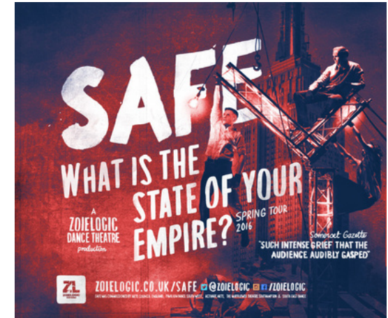
Below: SAFE 2017