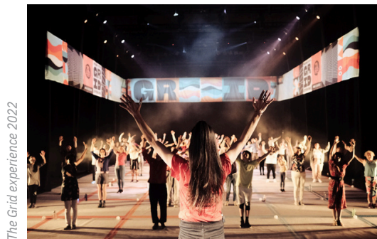
The Grid experience 2022

We work collaboratively with communities to co-create impactful programmes across arts, education, and wellbeing, making a tangible and visible difference to those we work with and the places they call home. From engaging workshops and vibrant festivals to long-term community initiatives, we guide individuals and communities on journeys to achieve extraordinary things and create unforgettable memories.