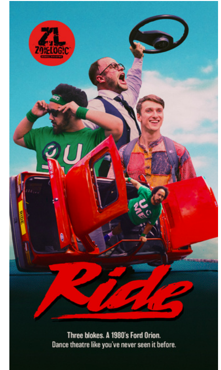
Above: 'RIDE' Commissioned and co-produced for International Dance Festival Birmingham 2016, co-commissioned by Gulbenkian (University of Kent) and Dance Village at Bristol Harbour Festival

SOLARA (2023) Outdoor Mass performance, Commissioned by FABRIC, supported by Dance Leaders Group (DLG), and funded by United by 22. Performed as part of the 2022 Commonwealth Games legacy event.