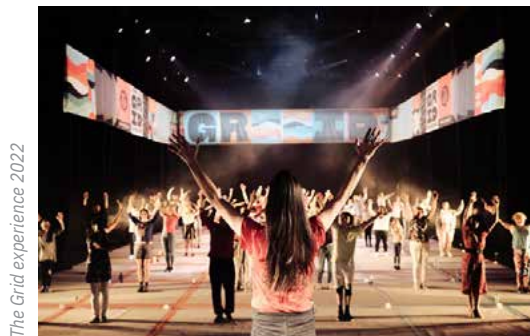
The Grid experience 2022

We work collaboratively with communities to co-create impactful programmes across arts, education, and wellbeing, making a tangible and visible difference to those we work with and the places they call home. From engaging workshops and vibrant festivals to long-term community initiatives, we guide individuals and communities on journeys to achieve extraordinary things and create unforgettable memories.